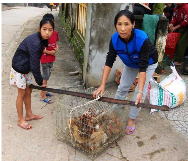
Woman and daughter take their chickens.

$1,200 Support chicken raising for 11 poor households. Provide water containers.