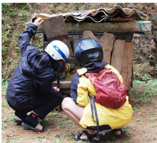
Inspecting a chicken house and getting the bicycle home on the back of a motorbike..

$1,000 Visit 10 households to support chicken raising & bicycle. Villages near Phong Nha.