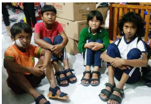
Photo wearing the new sandals.

Sandals and food for three households with street kids in Lam Ha town. This 1.5M ($100) project was: A strong pair of sandals for each of the four kids. 0.5M. For each of their three households, a 25kg bag of rice, 2 litres of cooking oil, a litre of fish sauce and a box of 30 noodle packets. 1M.