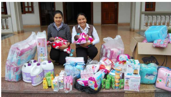
Nuns and two baby girls with our project.

$500 Support Mái Ấm Thiên Ân single mothers shelter, near Ha Tinh city.