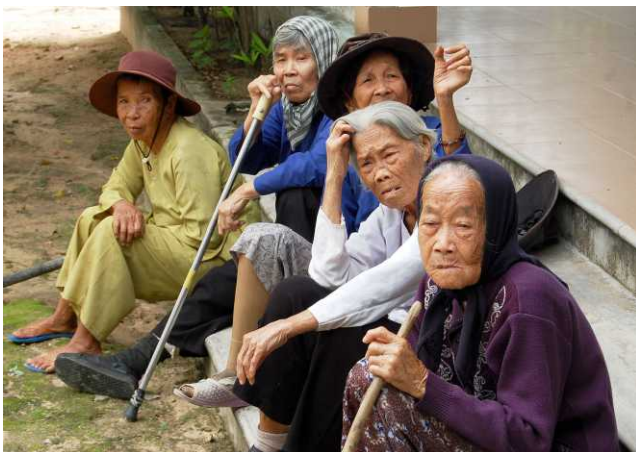
Lepers arrived to visit the nuns.

$185 - 3M. Medicine supply for village of 37 leper households (Trai Cui), Khanh Hoa Province, delivered to local nuns.