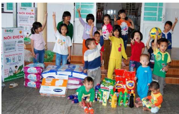
Children with our assistance project.

Cortisone cream for one child with severe eczema. 0.2M