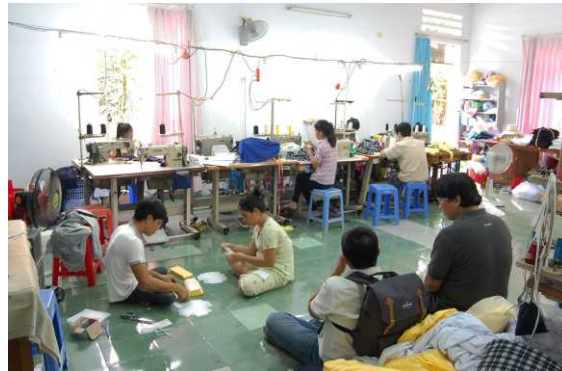
Disabled sewing workshop

$185 - 3M Lộc Thọ Pagoda orphanage, Nha Trang. Medicine package.