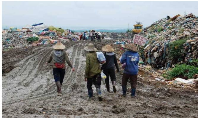
Pickers go back to work after collecting the protective clothing kits

Protective clothing for 50 scavengers, most of them local E-đê indigenous people, Buôn Mê Thuật City rubbish tip (4M): 20 pairs women's boots 30 pairs men's boots. 50 pairs of cloth work gloves. 50 pairs rubber gloves. 30 hats and cloth face masks for men. 20 cloth face masks including cap for women. Packets of sweet snacks for the workers.