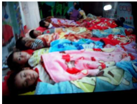
Blankets for 20 disabled children.

School bags, exercise books and pens for 10 disadvantaged children in villages around Phát Diệm and blankets for 20 disabled children in the convent kindergarten. 5.26M ($335).