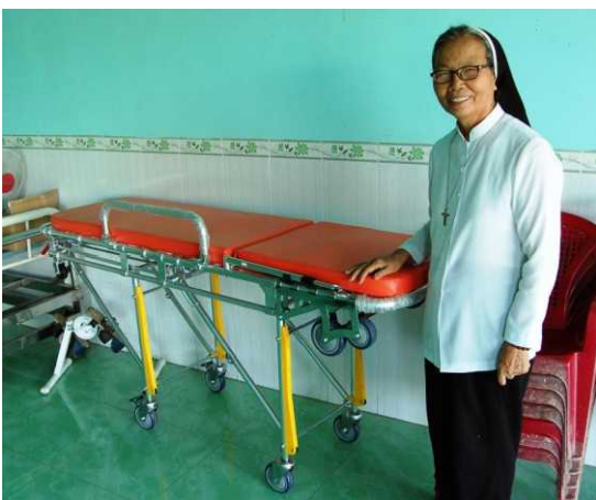
With our project, a transfer trolley for the sick and dying.

Trolley for transferring sick people for treatment and the dead for burial prep, homeless women's shelter, Đồng Nai.