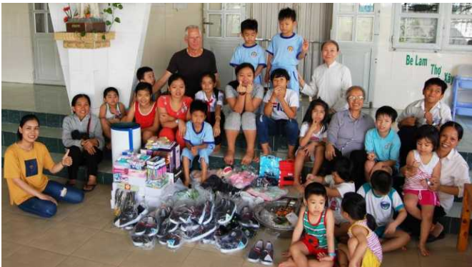
Children, nuns and interpreter with our project of school shoes, study supplies and other provisions.