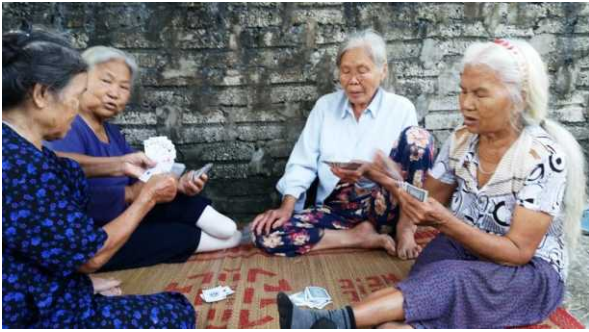
Leper women relaxing on the footpath to enjoy a game of cards

$160 to encourage one household, Quỳnh Lập Leper Colony.