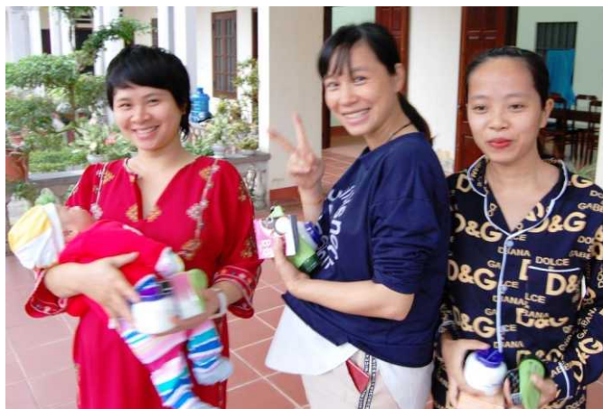
These women bravely agreed to smile for a photo with our project of baby care items.

For three mothers, each: shampoo, face wash, moisturiser, foundation, lipstick. The women appeared particularly happy with the beauty items. Hopefully the beauty items made the women feel better about themselves at this difficult time