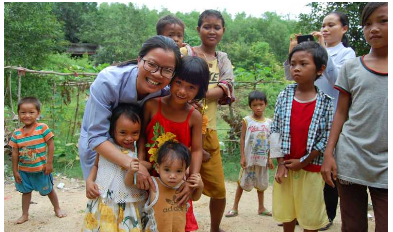
Young nun with Raklay people

$185 - 3M. Medicine for Mái Ấm Thiện Tâm orphanage, Nha Trang