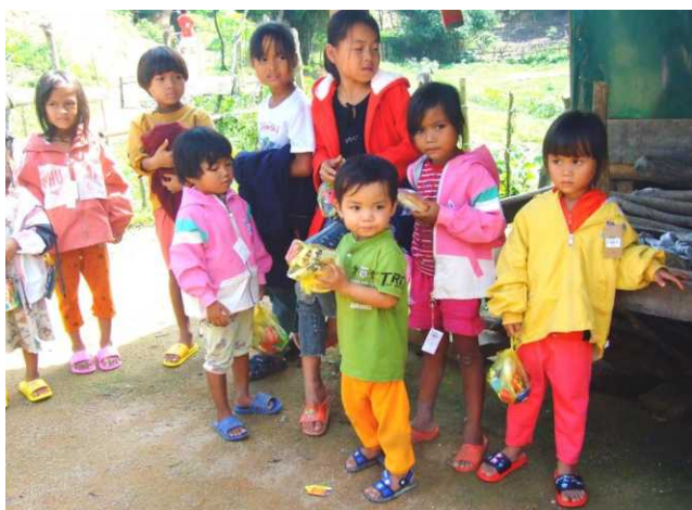
Children with their new clothes (some wearing shop tags) and sandals.

40 Vietnamese uni students of the Lasan Christian students social group visited the remote Van Kieu indigenous village of Bản Khe Ngài in Đắkrông in Quảng Trị with food and tree seedlings to plant. We funded for each of 20 village families to receive 500 cay tram tree seedlings to raise income and food as follows: 20kg rice, 1kg salt, 1 litre fish sauce, 1kg sugar, 1 litre oil. We also covered transport costs to this remote location.